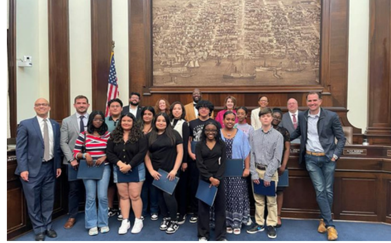
Junior City Academy graduates recognized by City Council on May 14.