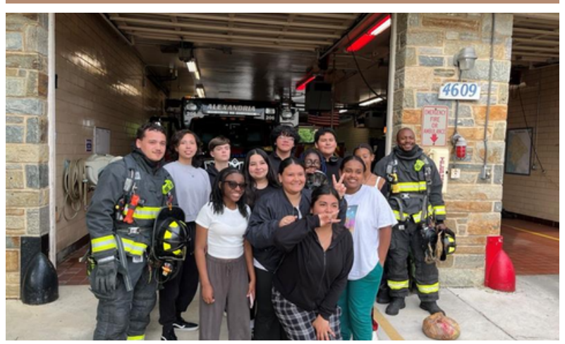
Junior City Academy visits Alexandria Fire Station 206.

The first Junior City Academy was successfully launched in April 2024. This academy, modeled after the City Academy, is specifically for young people ages 13 – 17. Throughout the course of six weeks, 12 middle and high school students visited City Hall, the Alexandria Sheriff's Office, the Alexandria Police Department, the Offices of Zoning and Code Administration, Transportation & Environmental Services, Court Services, and the Alexandria Fire Department. The goal was to help to demystify authority figures and build a sense of comradery for the kids that participated, while introducing them to a potential career path. Of the youth that participated, 70% became more familiar with city departments, 40% reported being more comfortable with city officials or authority figures, and 60% reported being more knowledgeable about accessing city resources.