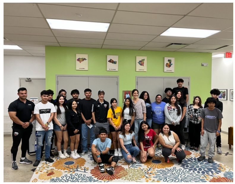
D.C. United visits with Pillars youth participants at Casa Chirilagua.

The Pillars Series is based on seven pillars: Goal Setting, Relationships, Responsibility, Self Confidence, Discipline, Service, and Leadership. To help deliver the message the task force enlisted successful individuals from many arenas to lead a discussion, we bookended the second series at Casa Chirilagua with D.C. United soccer players, along with participation by a real estate professional, professional musician, and fitness trainer. The Pillars series provides a blueprint for success so the youth can be a Pillar of their Family, their Community, and their Future. Following the series, about half of the participants surveyed reported a heightened passion for a specific personal or professional goal.